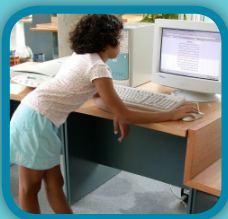
Second Step: Selecting