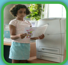
Last Step: Reading