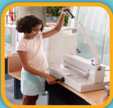
Fifth Step: Cutting