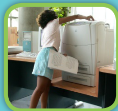
Third Step: Printing